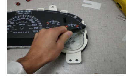
Remove the factory gauge face.