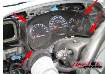
9. Remove the 4 screws holding the cluster in.