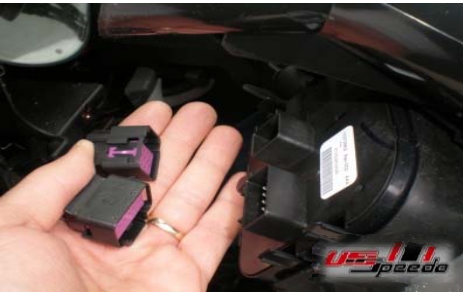
8. Unplug the head light switches.