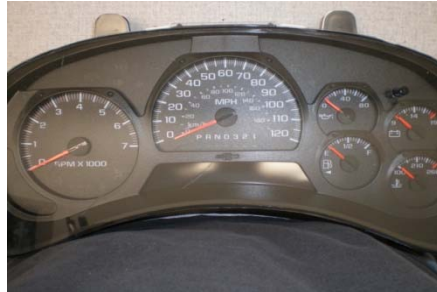
Make sure the key is in the off position and mark the needle position on the diagram provided.