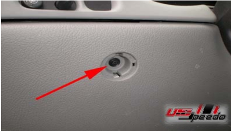
4. Remove the screw under the cap.