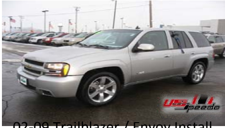
02-09 Trailblazer / Envoy Install Guide