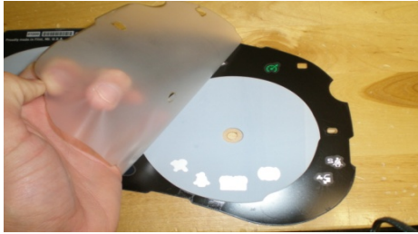
Remove the plastic liner on the back of the new gauge face, exposing the adhesive.