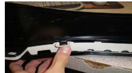
Remove the cluster, place on a flat surface and remove the lens cover.