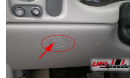
3. Use a small screw driver to remove this cap. It snaps off.