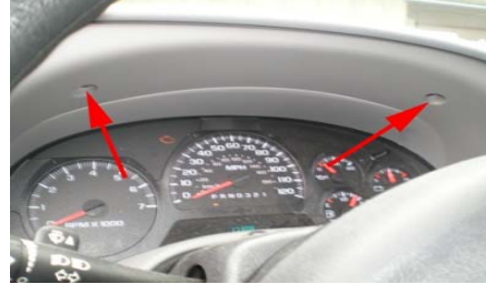
2. Remove the screws above the cluster.