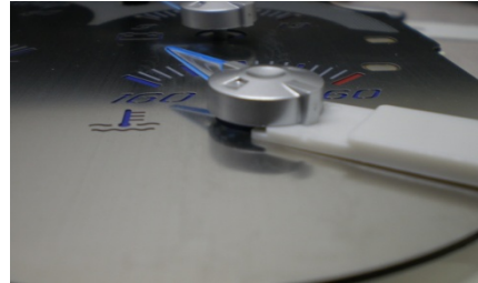
Push the needles down using the end of the needles tool as a height guide.