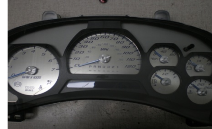
Place the lens back onto the cluster and install.