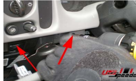
6. Pull down the knee trim plate and remove screws on both side.