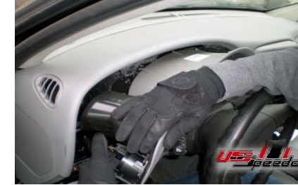
7. Pull on the trim around the cluster.