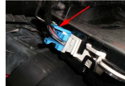
10. Did you mark the needle position? Make sure the key is off before unplugging.