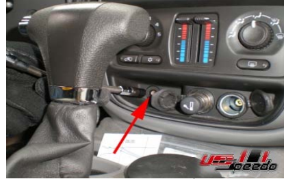
5. Remove the screw in the center.