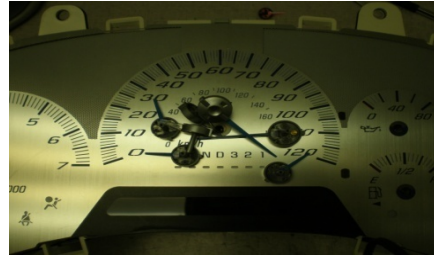
take the cluster and the needles back to the vehicle and plug in the cluster. Make sure the key is in and in the off position.