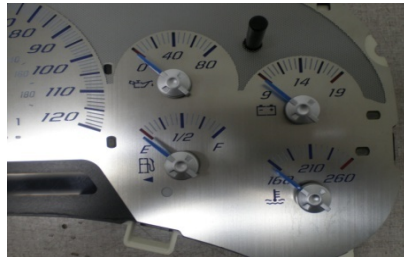
Plug the cluster back into the car and if the needles go back to the zero position unplug the cluster again.