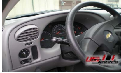
1. Before you start mark on the diagram each needle position with the key off.