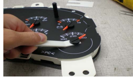
Remove the needles using the tool provided in the kit.