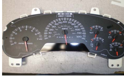
Twist the needles down past the lowest mark.