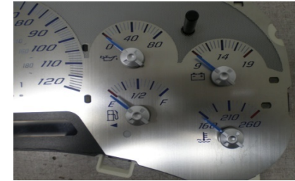
Place the needles in the position that you marked on the diagram. Do not push them all the way down yet.