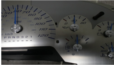
Unplug the cluster again and turn the needles all the way up .